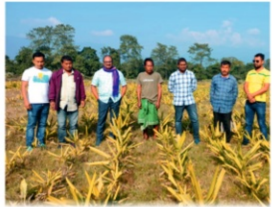
Field visit of Organic Turmeric