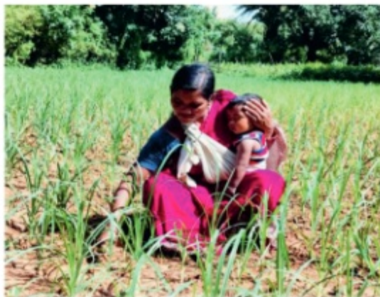
Woman Farmer in Organic Millet Fields, Kandhamal