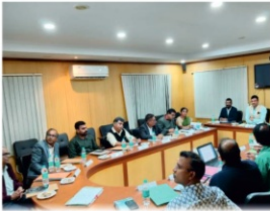
4 TH GB Meeting of OSOCA