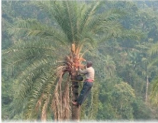
Wild Date Palm Sap Collection, Gajapati