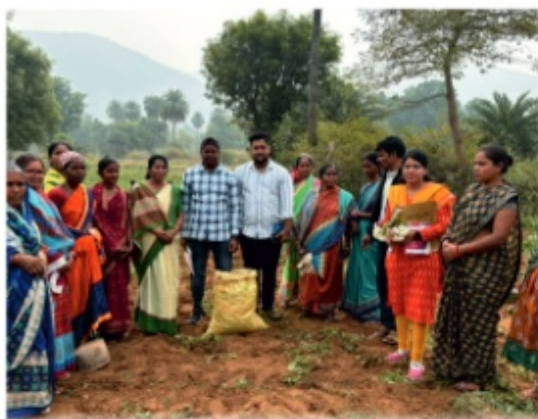
Field visit of OLM cluster of women FPO