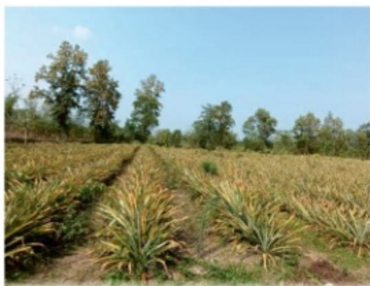
Organic Pineapple Area, Assam