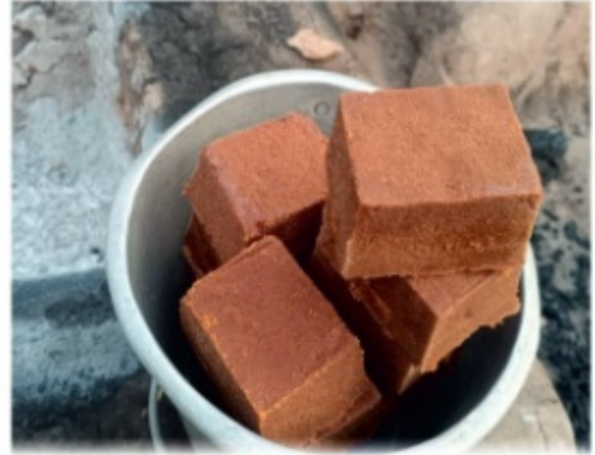
Organic Date Palm Jaggery Cake