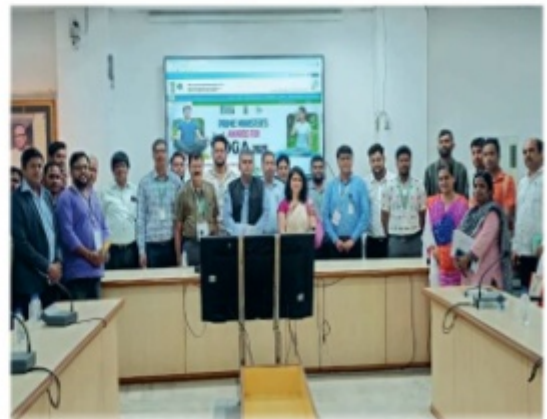
OSOCA with Chairman, APEDA, GM and other Operators at OUAT, Bhubaneswar