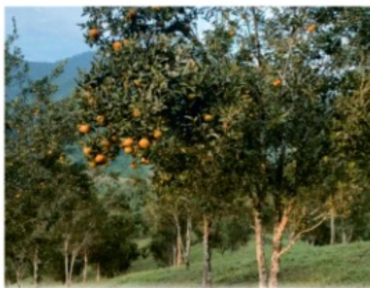
Organic Orange Farm, Arunachal Pradesh