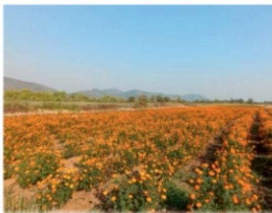
Organic Medicinal Farm near Cuttack