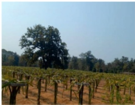
Organic Dragon Fruit Farm, Patnagarh