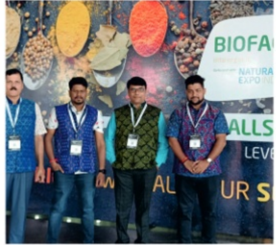
OSOCA stall in BIOFACH INDIA 2024 at Greater Noida