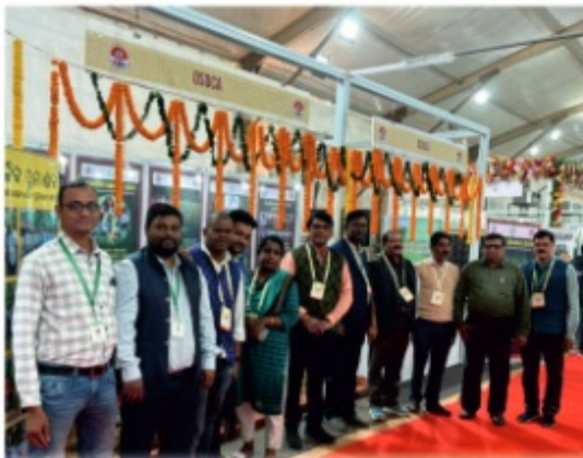
OSOCA Stall at Krushi Odisha, 2025