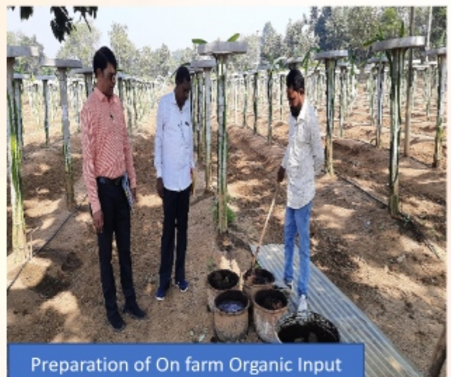
Preparation of On farm Organic Input