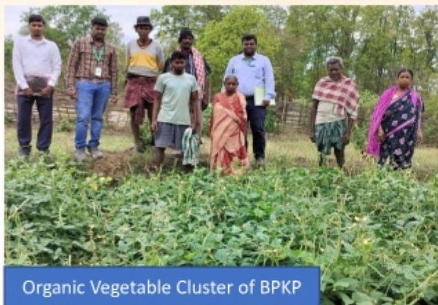
Organic Vegetable Cluster of BPKP