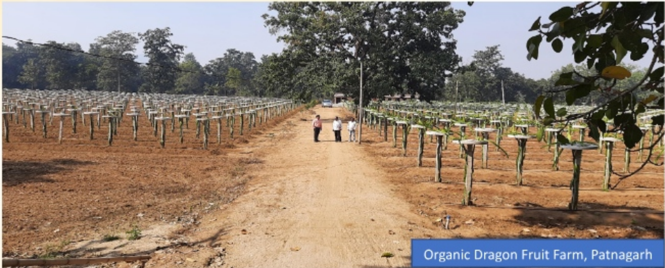
Organic Dragon Fruit Farm, Patnagarh