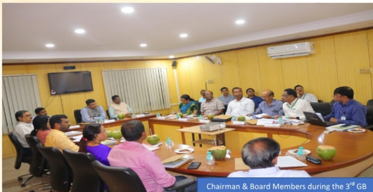
Chairman & Board Members during the 3 rd GB