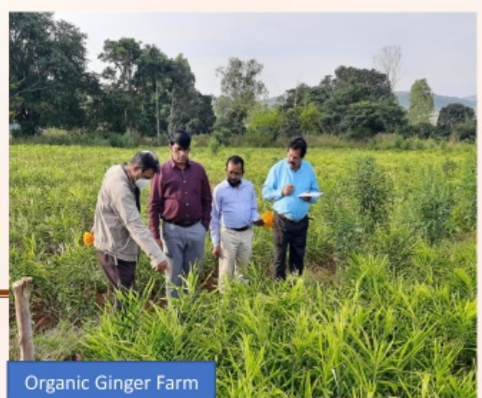
Organic Ginger Farm