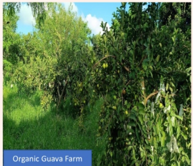
Organic Guava Farm