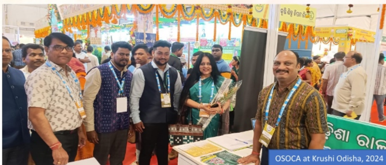
OSOCA at Krushi Odisha, 2024