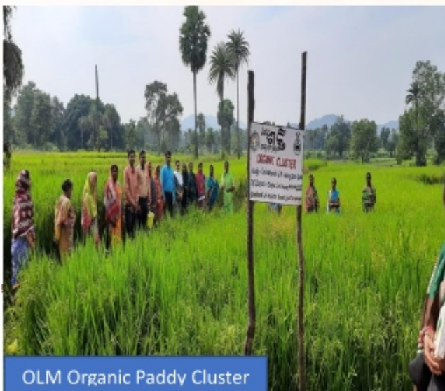
OLM Organic Paddy Cluster