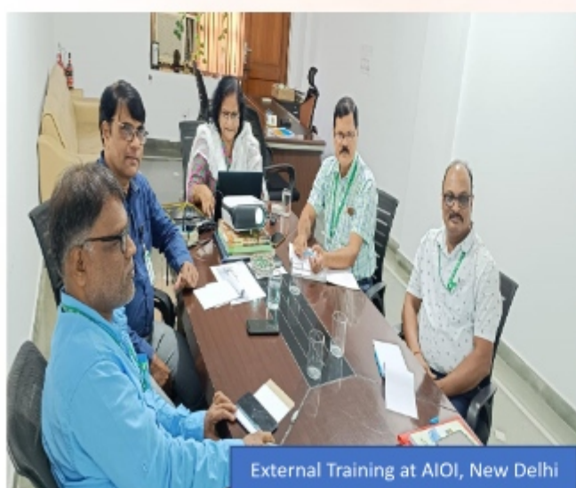
External Training at AIOI, New Delhi