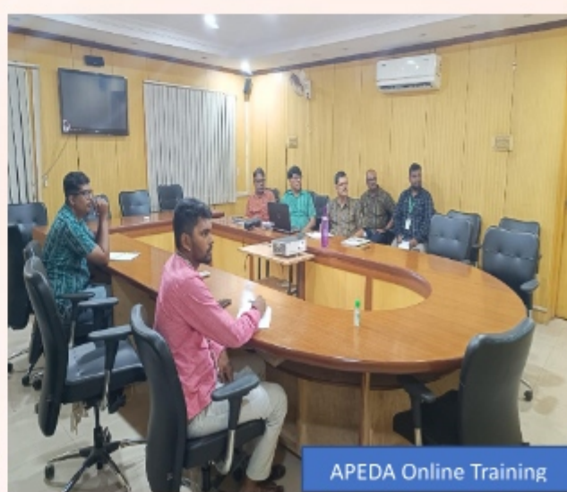
APEDA Online Training