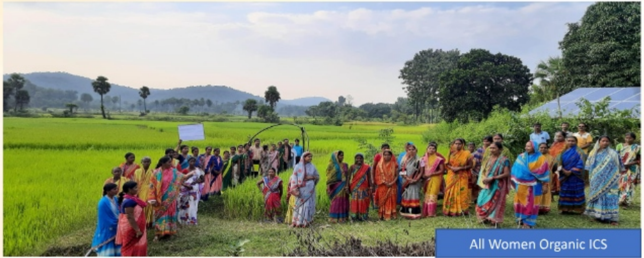
All Women Organic ICS